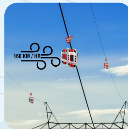
Tested for Wind speed upto 160km / Hour