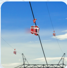
Aviation Lights (Aviation Warning Light)