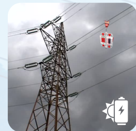
Powerful Battery and less power consuming-ultrabright LEDs makes it work for 48-72 hours in case snow and low sun light conditions