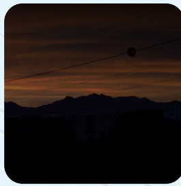
Is not visible during Night when it is required the most